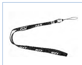
R001— Hand Strap