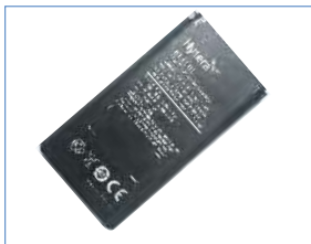
BL3101— Li-ion Battery