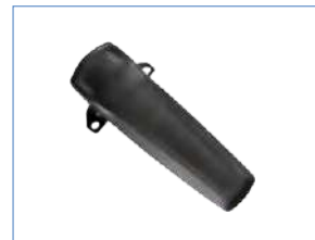
BC08— Belt Clip