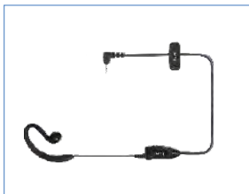
EHS16— C Style Earpiece