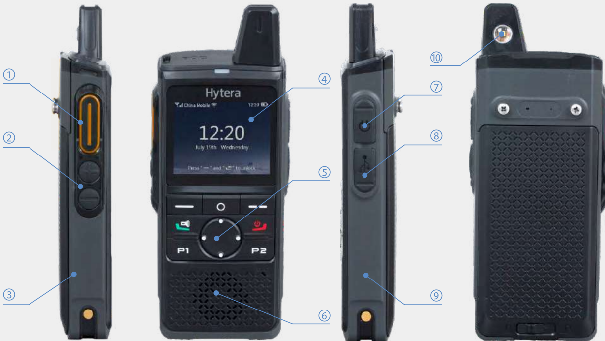
① Push-To-Talk Button ② Volume Up/Down ③ Built-in GPS ④ 2.0" TFT Screen ⑤ Half Keypad ⑥ Superior Audio ⑦ Audio Jack ⑧ USB 2.0 Port ⑨ Built-in Bluetooth ⑩ LED Torch