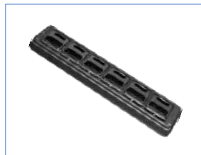
MCL23— Multi-unit Charger